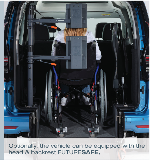
Optionally, the vehicle can be equipped with the head & backrest FUTURESAFE .