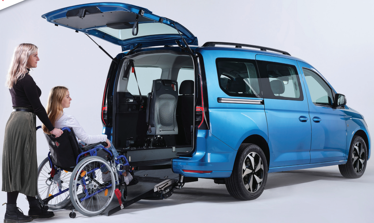
Image shows Ford Grand Tourneo Connect