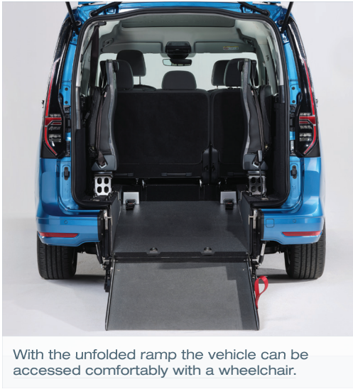
With the unfolded ramp the vehicle can be accessed comfortably with a wheelchair.

Ford Tourneo Connect / Ford Grand Tourneo Connect